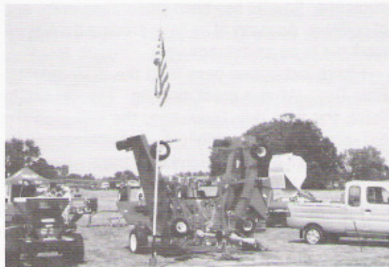
The trade show had everything for turf managers from the largest to the smallest equipment.