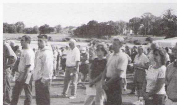
The crowds eagerly anticipate the start of the research tour.