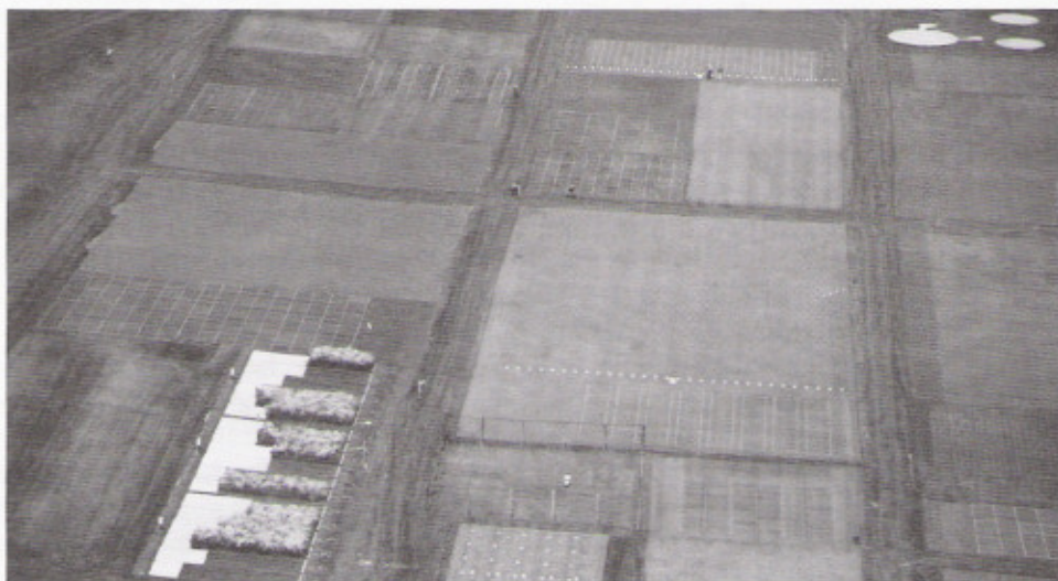
The plots at the Noer Facility painted, signed, and ready to show for Field Day.