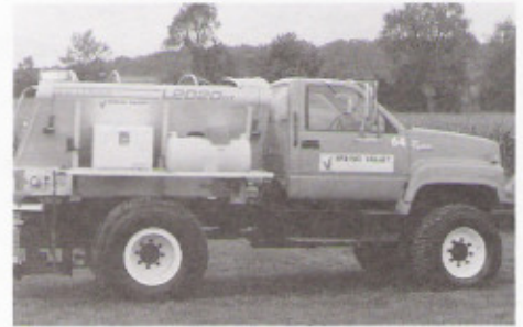
Spring Valley Turf products brought some impressive equipment.