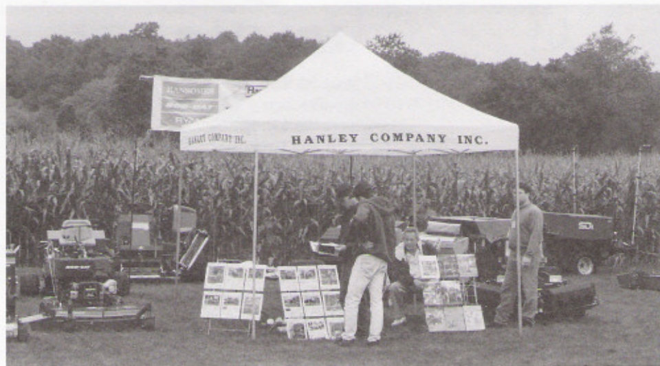
Hanley Company along with most exhibitors had lots of new innovations to talk about.

Absorbent Technologies Bayer Corp Cannon Turf Century Rain Aid Chipco Conserv F/S Contree Sales DGS & Associates Finn Corp FS Seed Glenn Rehbein Great Lakes GC Products Greensmix Hanley Hanson & Assoc Horst Distributing IMC Vigoro J W Turf Johnson & Associates KEI Kellogg Seed Lebanon Turf Lesco McFarlane Implement Melcher Equipment MidAmerCo Miller & Assoc Milorganite Neary Mfg Olds Seed Olsen Dist Par Aide Products Pendelton Turf Supply Pro Greens of the Midwest ProGreen Plus ProLawn Reinders Reinders Irrigation Rhody's Town & Country Rohm & Haas Scotts Co Soil Organics Consulting Sports Turf Association Spring Valley Turf Tee Shot Marketing Terra International Tiziani Golf Cars TJ Emmerich and Associates Trelay Seed Company United Horticultural Supply WDATCP Wisconsin Turf Wolosek Landscaping Zeneca Products