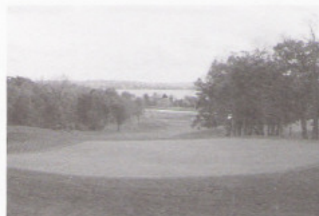
Bishop's Bay provided a beautiful site with Lake Mendota in the background.