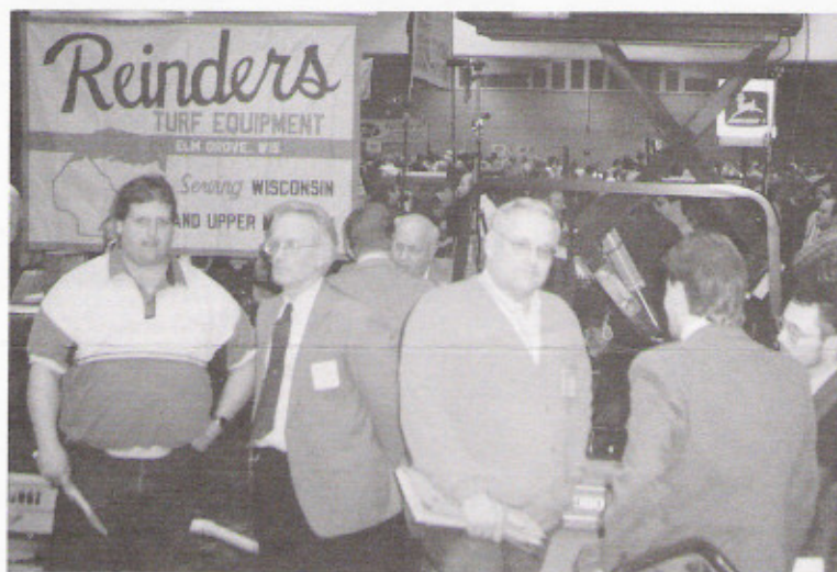
The Holiday Inn is a great venue for the large trade show.

Some of the talks will have an international flavor as they touch on subjects like California greens, Japanese snow molds, and turf for North Carolina football teams to name a few. But all the talks will include information that relates to growing and managing turfgrass in our region. Learn about development of new turfgrasses like Poa supina and greens type selections of Poa annua , or learn how to choose some of the best Kentucky bluegrass cultivars from the scads of choices available to you. There will be a wealth of ideas on topics covering all stages of sports field management, greens construction, and nutrient management for lawn care. You may also learn about growing grass under trees and in covered stadiums where low light conditions exist. Plant growth regulator use will be explored and numerous experts will reveal how to manage different turfgrass diseases.